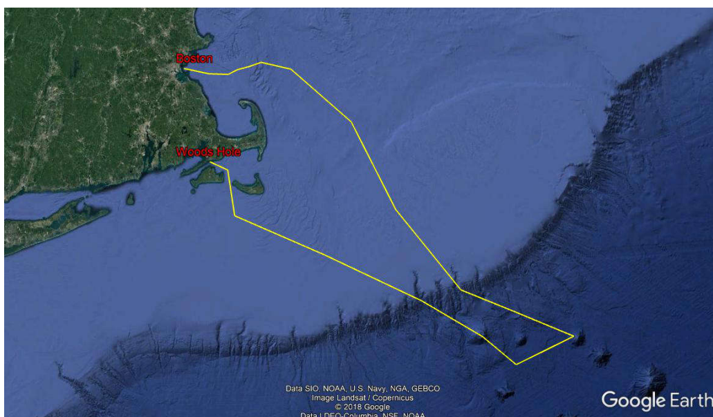
Figure 2. Possible SEA Expedition offshore voyage track that travels to both the Northeast Canyons and Seamounts Marine National Monument and Stellwagen Bank National Marine Sanctuary. For scale, the seamount region shown in the lower right corner of this chart (the furthest offshore portion of the illustrated voyage track) is approximately 225nm from Woods Hole.